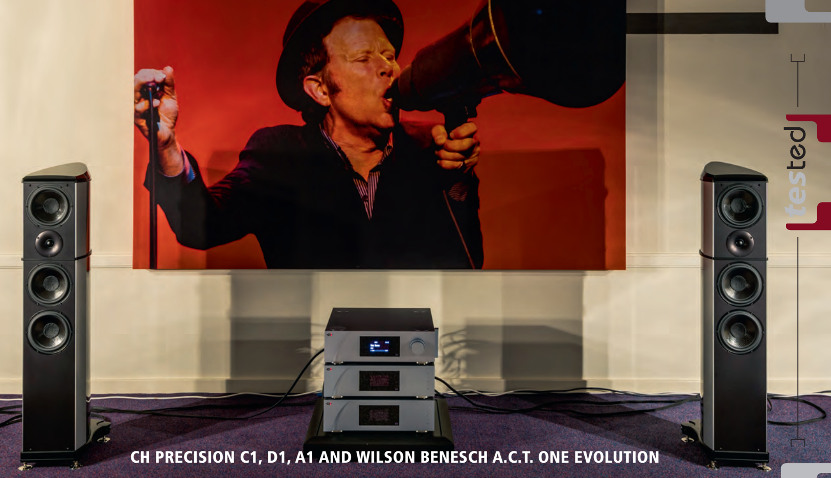
CH PRECISION C1, D1, A1 AND WILSON BENESCH A.C.T. ONE EVOLUTION